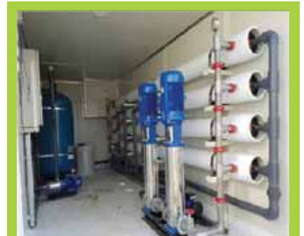
Ultratec® Containerized RO Plant

Ultratec water treatment llc is a market leader in Water treatment plants design and continuously incorporates new membrane technologies such as nano filtration, ultra filtration and micro filtration for the production of drinking and industrial water. Our uncompromising commitment to superior quality and durability is reflected in the extensive use of high grade stainless steel fabrication and components that provide high resistance to corrosion. The fail-safe mechanisms sourced from leading manufactures protect major components and deliver accurate perfor-